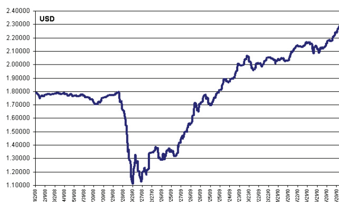
PRUlink US Dollar Fixed Income Fund