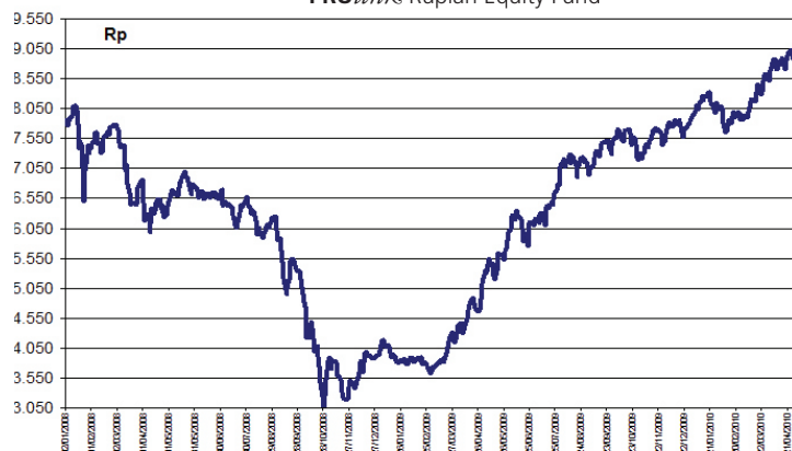
PRUlink Rupiah Equity Fund