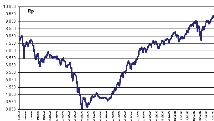
PRUlink Rupiah Equity Fund