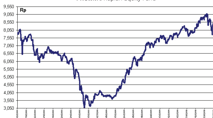
PRUlink Rupiah Equity Fund