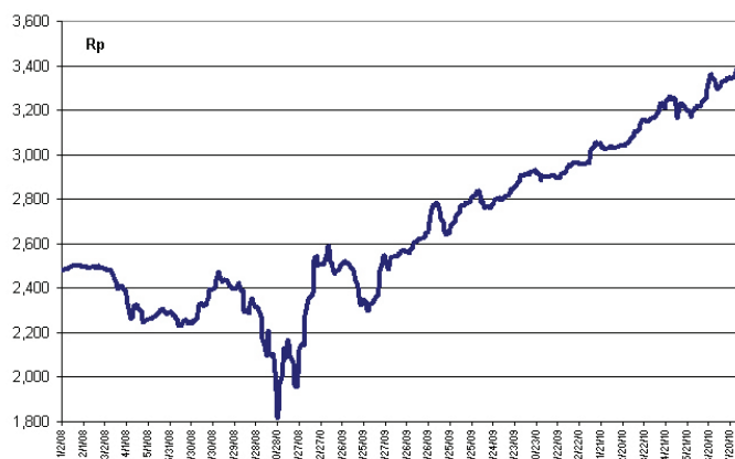
PRUlink Rupiah Fixed Income Fund