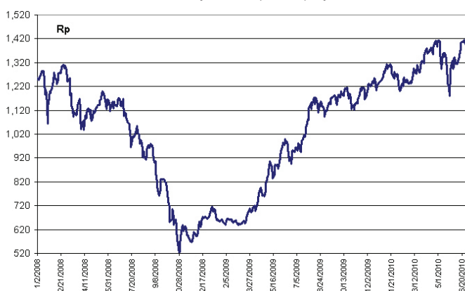
PRUlink Syariah Rupiah Equity Fund